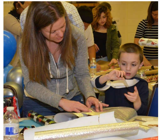
Everyone gets in on the fun at OAR's gift wrapping party.

A-SPAN (for the new indoor Homeless Services Center)-- While they will be able to put to good use everything that was given, they were especially thrilled with the towels and washcloths as those additions allowed them to supplement what they had to more easily meet the needs of those using the shelter on a regular basis.